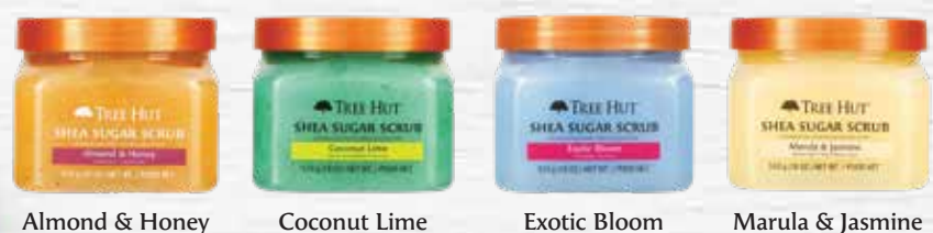
Almond & Honey Coconut Lime Exotic Bloom Marula & Jasmine