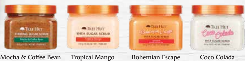
Mocha & Coffee Bean Tropical Mango Bohemian Escape Coco Colada