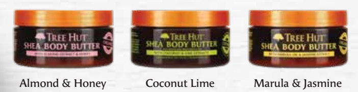
Almond & Honey Coconut Lime Marula & Jasmine