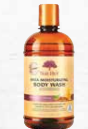
Almond & Honey