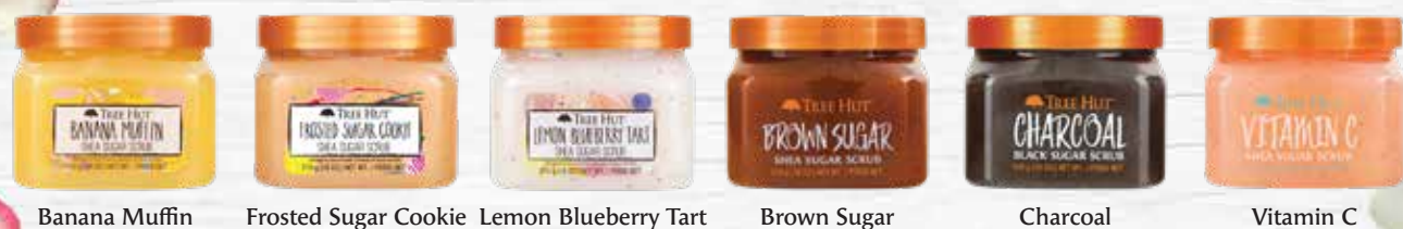
Banana Muffin Frosted Sugar Cookie Lemon Blueberry Tart Brown Sugar Charcoal Vitamin C