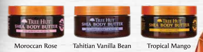
Moroccan Rose Tahitian Vanilla Bean Tropical Mango