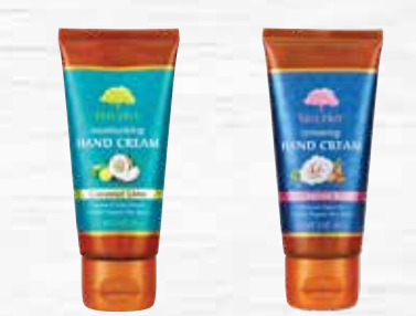
Coconut Lime Moroccan Rose