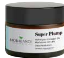
SUPER PLUMP CREAM MOISTURIZER HYDROLYZED COLLAGEN 3% + HYALURONIC 3D 1,5%