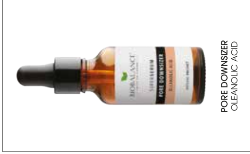
PORE DOWNSIZER OLEANOLIC ACID