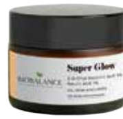
SUPER GLOW GEL CREAM MOISTURIZER 3-O-ETHYL ASCORBIC ACID 5% + FERULIC ACID 1%

6 BROAD SPECTRUM PROTECTS FROM UVA & UVB