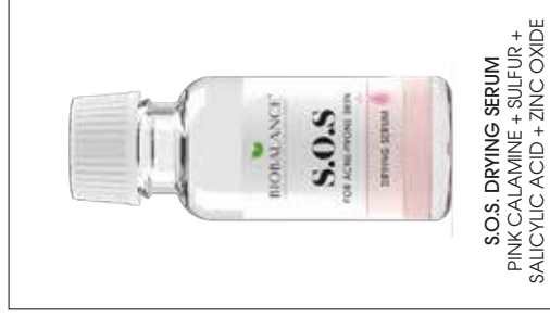
S.O.S. DRYING SERUM PINK CALAMINE + SULFUR + SALICYLIC ACID + ZINC OXIDE