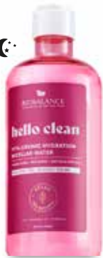
HYALURONIC HYDRATION MICELLAR WATER +AMINO ACIDS + PENTAVITIN + CENTELLA ASIATICA