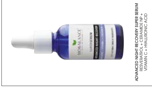
ADVANCED NIGHT RECOVERY SUPER SERUM RESVERATROL + CERAMIDE NP + VITAMIN C + HYALURONIC ACID