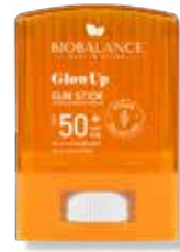
GLOW UP SUN STICK SPF50+ VITAMIN C + GRAPE SEED OIL + SEA BUCKTHORN OIL