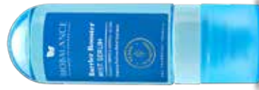
BARRIER BOOSTER MIST SERUM