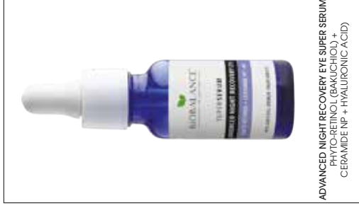
ADVANCED NIGHT RECOVERY SUPER SERUM PHYTO-RETINOL (BAKUCHIOL) + CERAMIDE NP + HYALURONIC ACID