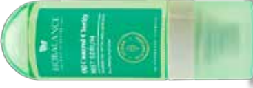
OIL-CONTROL CLARITY MIST SERUM

1% ARGININE + 1% 4D-HYALURONIC + COLLAGEN