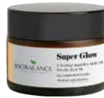
SUPER GLOW GEL CREAM MOISTURIZER 3-O-ETHYL ASCORBIC ACID 5% + FERULIC ACID 1%

5 BROAD SPECTRUM PROTECTS FROM UVA & UVB