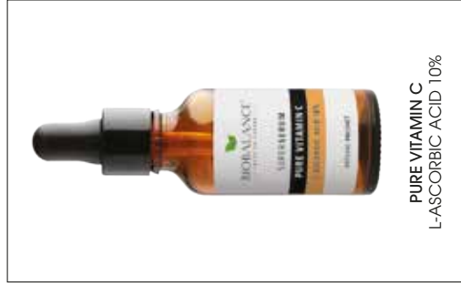
PURE VITAMIN C L-ASCORBIC ACID 10%