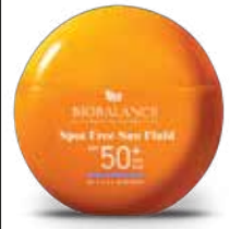
SPOT FREE SUN FLUID SPF50+ VITAMIN C + CARNOSINE + SCLAREOLIDE