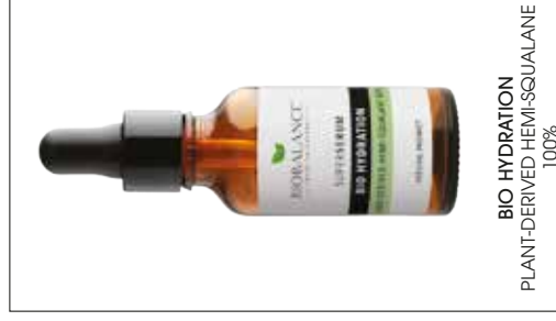
BIO HYDRATION PLANT-DERIVED HEMI-SQUALANE 100%