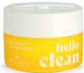
BRIGHTENING OIL BASED CLEANSING BALM