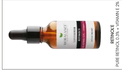
RETINOL PURE RETINOL 0.3% + VITAMIN E 2%