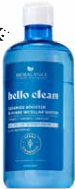
CERAMIDE BOOSTER BI-PHASE MICELLAR WATER +VITAMIN C + CHAMOMILE + SQUALANE