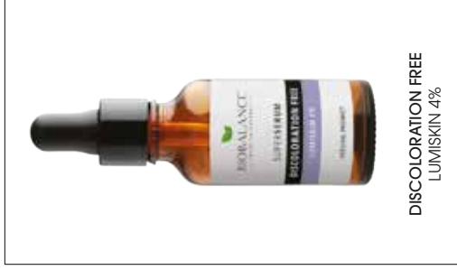
DISCOLORATION FREE LUMISKIN 4%