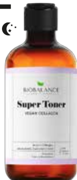
SUPER TONER VEGAN COLLAGEN